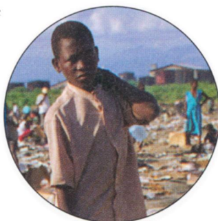
The customers: From left to right, a boy picks through a junkyard in Haiti; a pregnant 13-year-old girl cradles her 2-year-old brother outside of Monterrey, Mexico; and a child stands in littered water in a riverside slum in Ho Chi Minh City, Vietnam.